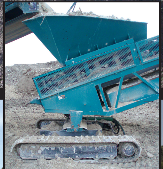
INDEPENDENT TRACK DOLLY UNDER FEED BOOT